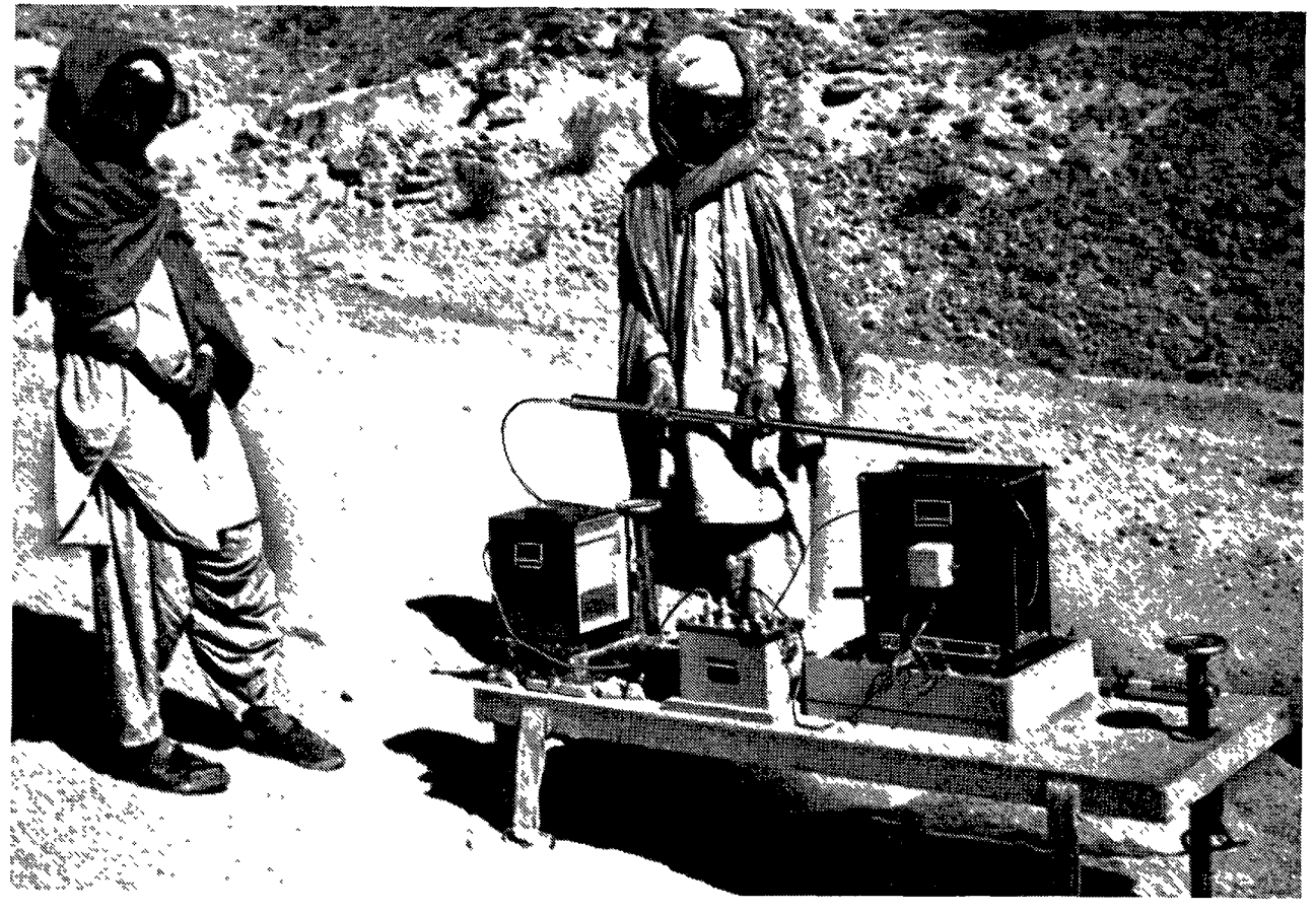
Figure 3. Borehole logging in Pakistan. The worker is standing behind the logger recording apparatus and the manual winch used to lower the probe into the hole, and is holding the probe itself in his hands.

Figure 2. Airborne \gamma -ray spectrometric system consisting of six large sodium iodide - NaI(TL)-detectors shown here in the foreground of the picture installed inside a survey aircraft, with the associated electronics behind the detectors.