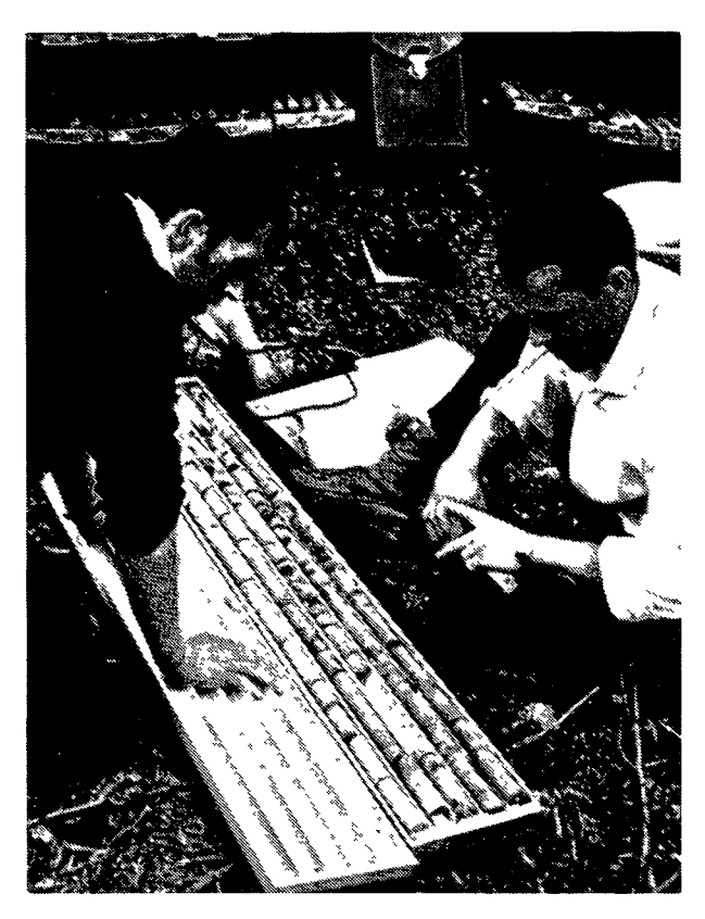
Figure 4. Drill-core examination and sampling in Saskatchewan, Canada. In general, this is a more expensive procedure than borehole logging.

Considerable judgement is needed regarding the appropriateness of field spectrometry at any given exploration stage.