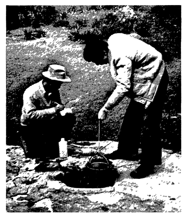
Figure 6. Sampling water from a domestic well in Turkey to analyse its uranium and radon content.

choice of a suitable array of electrodes is dependent on many factors — particularly the target geometry and the conductivity and thickness of the overburden. The socalled Wenner-Schlumberger and dipole-dipole arrays are the most widely used. In general, the interpretation techniques for induced polarization are nowhere as advanced as for resistivity. These electrical techniques are used only at the detailed exploration phase, where a target has already been defined, on any other conducting zones, and to determine the thickness of the sedimentary strata over known structure or deposits. Resistivity and induced polarization surveys can provide guidance in planning drilling programmes.