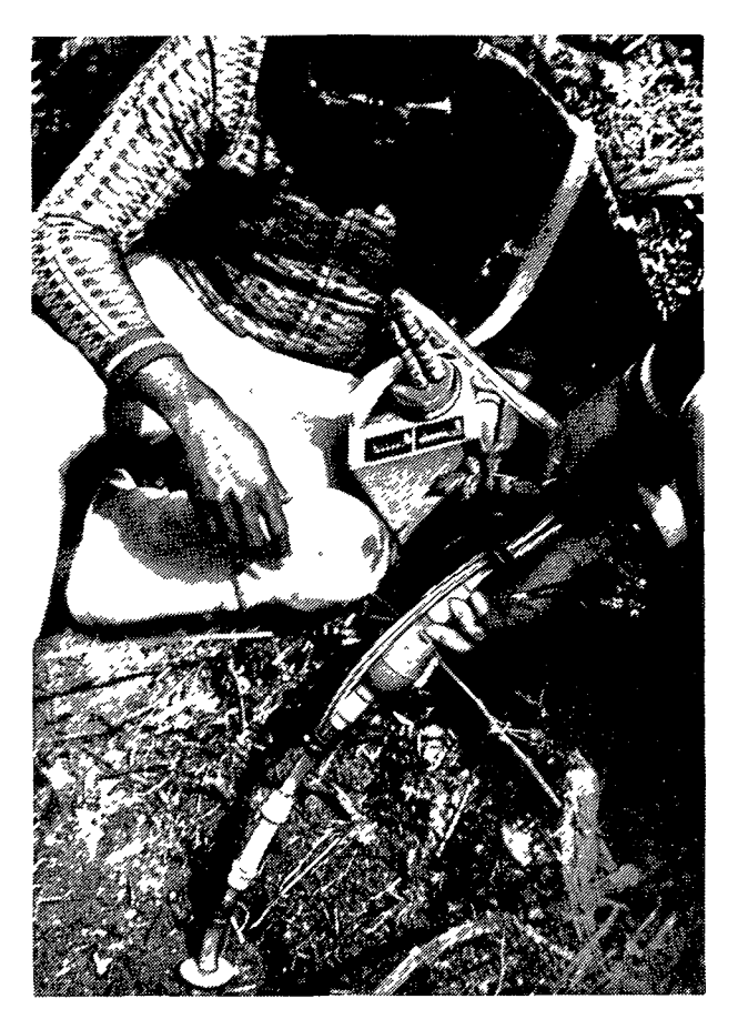
Figure 5. Measurement of radon gas in soil.

Intermediate-density sampling surveys (scale 1:20 000-1:50 000): The objective of the intermediate phase is to locate and determine the origin of surface anomalies within the areas of interest delineated in the course of lowdensity sampling. This is accomplished by increasing the sampling density to 10-20 samples/km<sup>2</sup>. At the same time an attempt is made to relate the anomaly to the local geology, stratigraphy, and tectonics. Water and stream sediment samples are taken from all streams in the anomalous zone. Where possible, seepage and spring waters are sampled in addition to well-water. If the geology of the anomalous area is not well known, more geological information on the anomalous zones should be obtained. If such intermediate prospecting only rarely locates uranium-bearing ores, it nevertheless permits substantial reduction of the area of interest, assessment of its potential, and a better understanding of the origin of the geochemical anomaly. It is then possible to select the method best suited for further studies - such as geochemistry, radiometry or a geophysical technique.